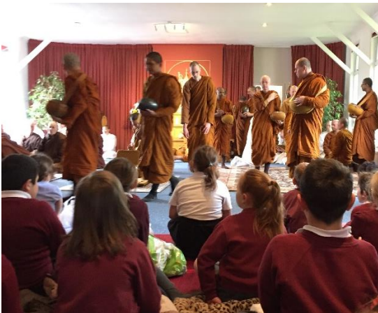
Y1-6 joining Buddhist Monks for lunch

I am pleased to be able to share the results of our recent HMI monitoring visit, which recognises that we have taken effective action in response to our OFSTED inspection back in September. It is wonderful to have external recognition of the positive impact changes since September have had on raising standards for your children. I will discuss the letter at Parent Forum on Friday 26 th April. Please contact me if you have any questions and are unable to attend the forum meeting.