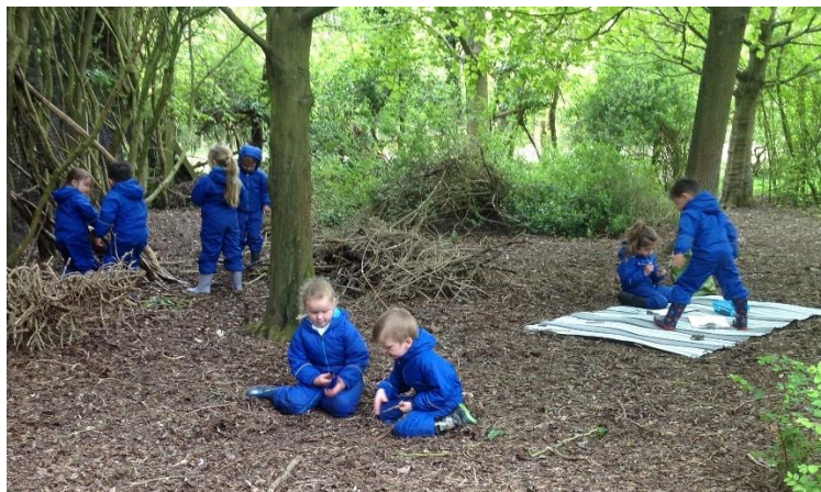
Nursery and Reception enjoying Forest School activities

Years 1-6 thoroughly enjoyed their trip to the Buddhist Temple on Monday. The whole group took part in a guided tour of the temple and had lunch with the monks. One of the highlights was trying out meditation. Other visitors to the centre and the monks themselves praised our children's respectfulness and thoughtful questioning. Staff and children were so inspired by their visit they are going to continue to use meditation back in school during worship and at appropriate times in the day.