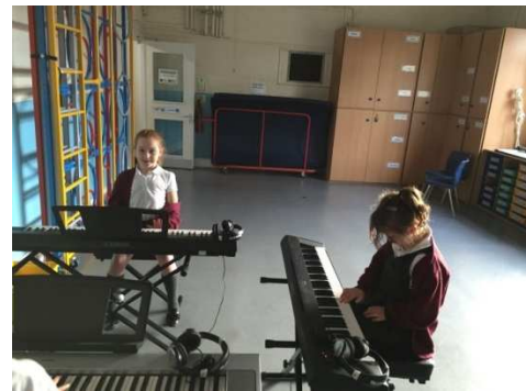
Juniors enjoy their first piano lesson