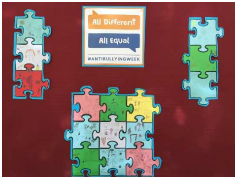
Our Anti-Bullying Week Learning